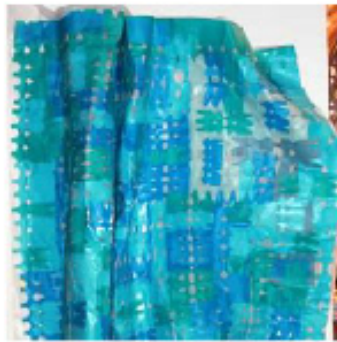
BULU, MIXED MEDIA TAPESTRY PAINTING, 3 X 4 FT, 2014