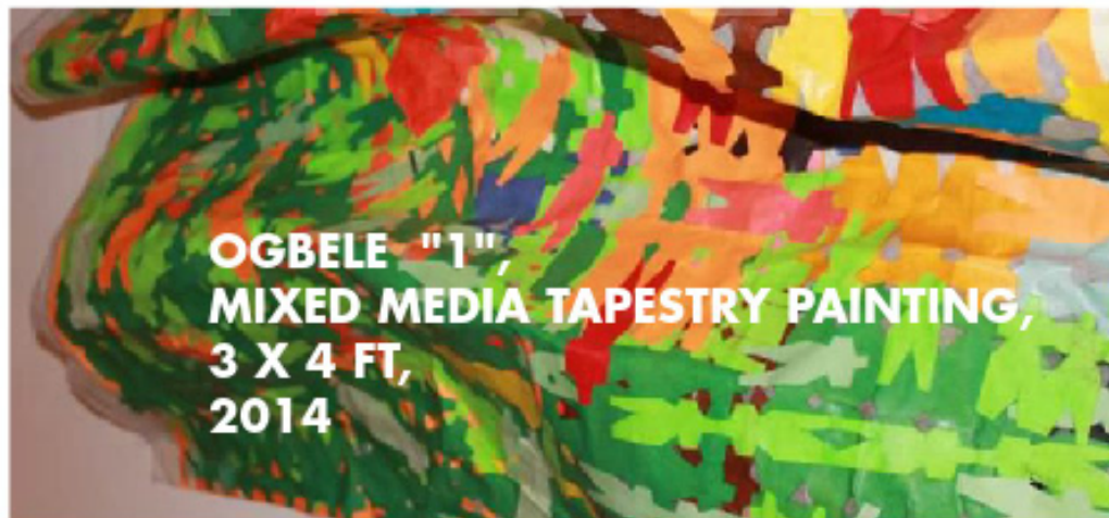
OGBELE "1", MIXED MEDIA TAPESTRY PAINTING, 3 X 4 FT, 2014