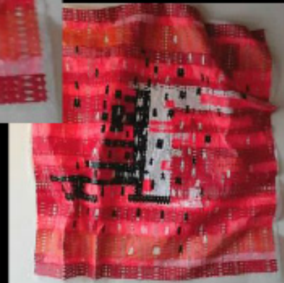
OJU AJA NSEJE, MIXED MEDIA TAPESTRY PAINTING, 8 X 8 FT, 2014