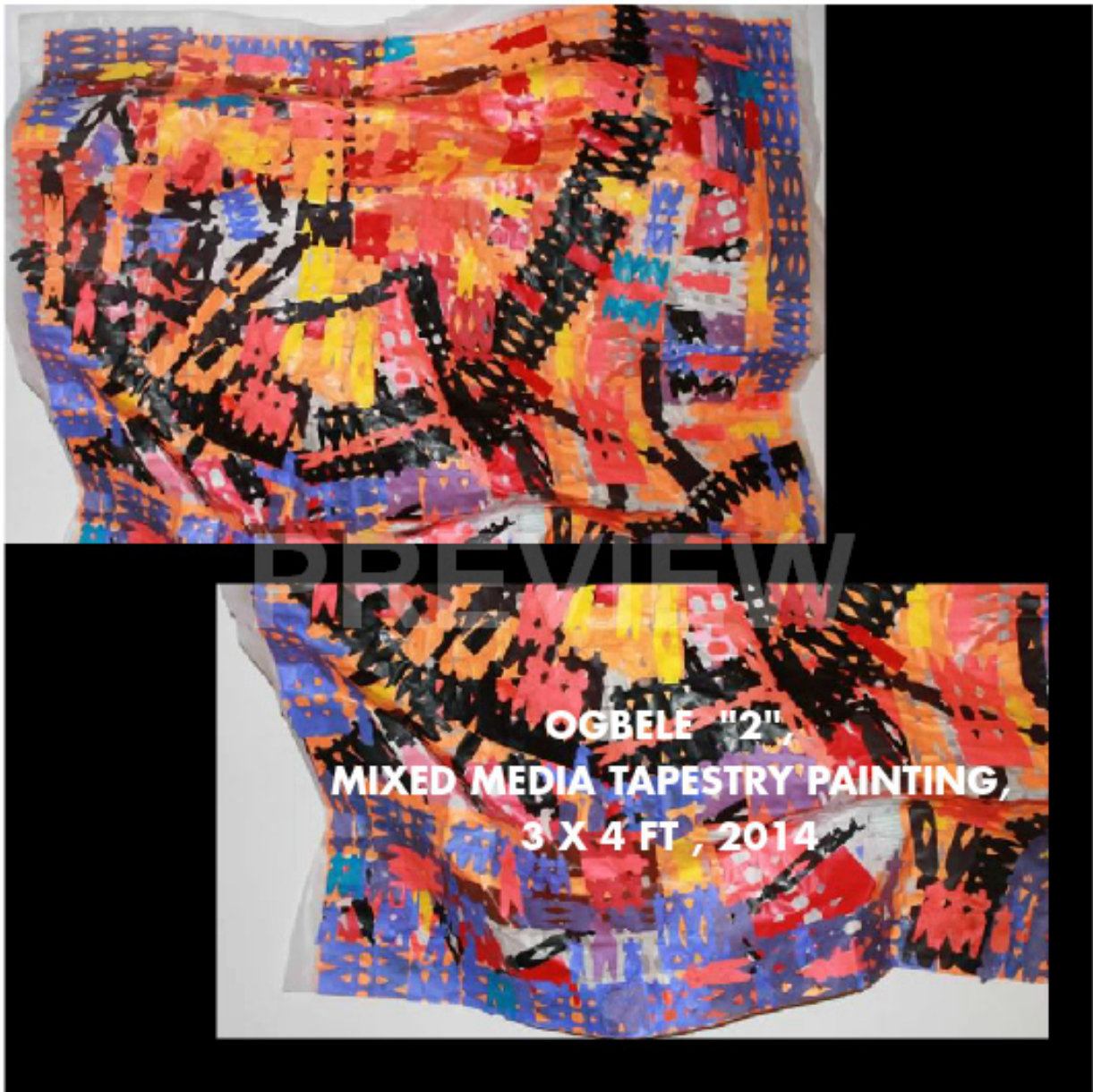
OGBELE "2", MIXED MEDIA TAPESTRY PAINTING, 3 X 4 FT , 2014