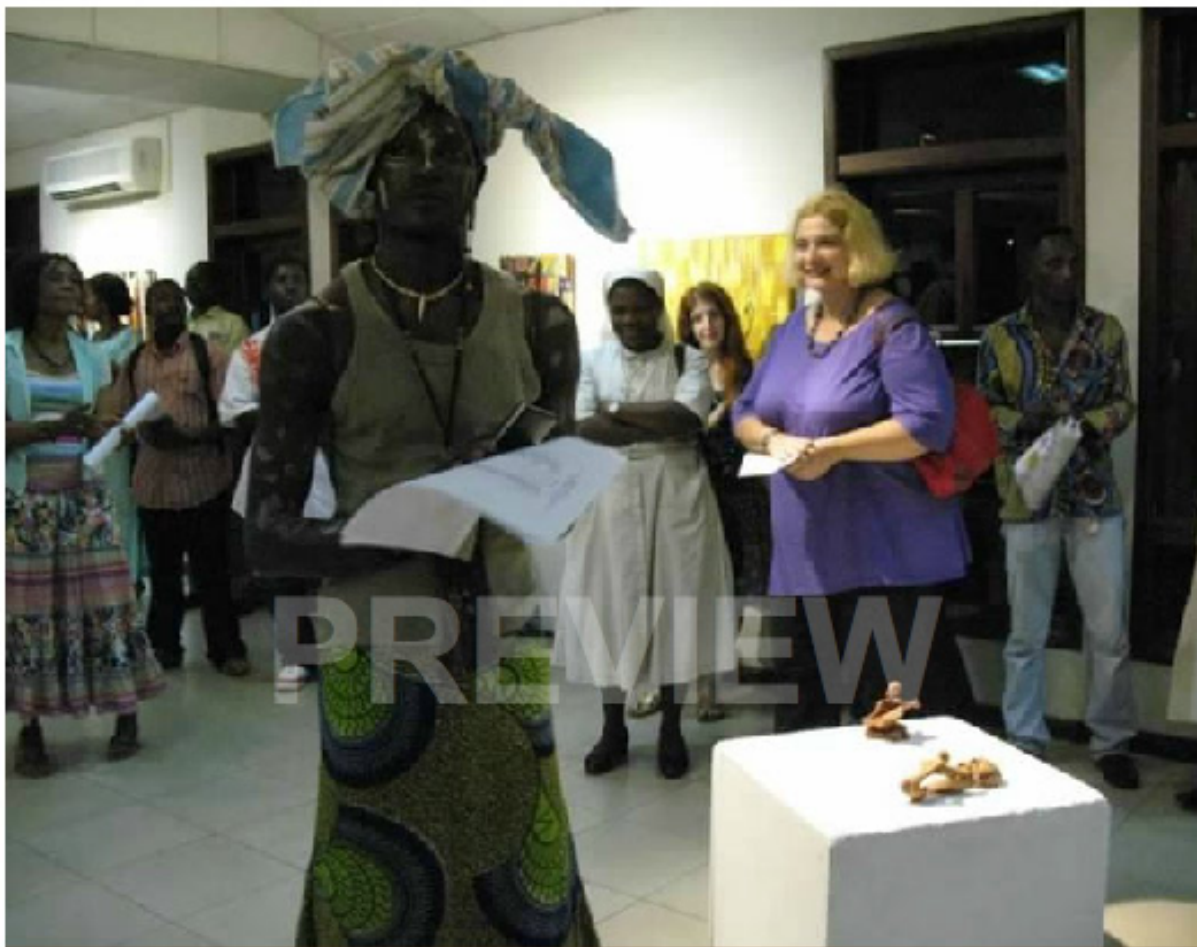
MA JO FUN IYA MI AGBA/ DANCE FOR MY GRANDMA ALLIANCE FRANCAISE ACCRA 2007