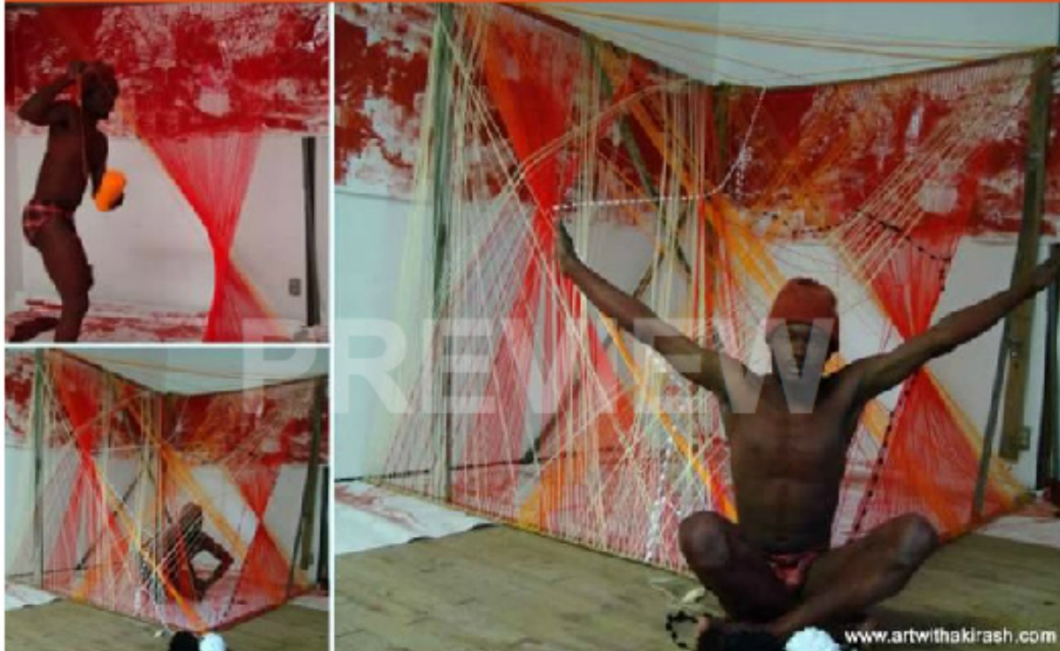
AFOKU GIJI/BROKEN MIRROR, ART FARM NEBRASKA, 2011, POLITICIANS VS. VOTERS