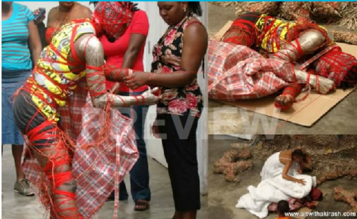
isiCelo/PETITION, NIROX GALLERY JOBURG, 2012, HERE I INHABIT THE HOMELESS WHO SLEEP ON THE STREET, UNDER BRIDGES, AND IN UNCOMPLETED BUILDINGS, WITH BOXES AS THEIR BLANKETS.