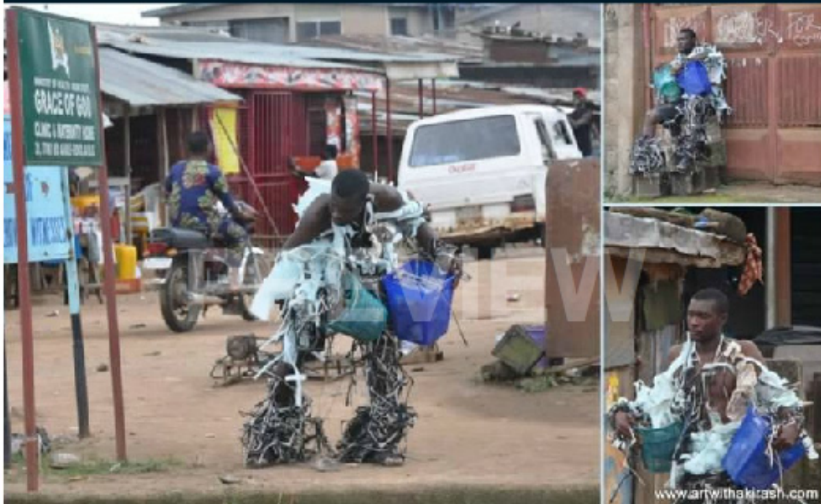
ABAWON/STAIN I LAGOS, NIGERIA 2010. THIS PIECE EXPLORES HOW WE REACT TO THOSE WHO ARE MENTALLY CHALLENGED IN OUR SOCIETIES.