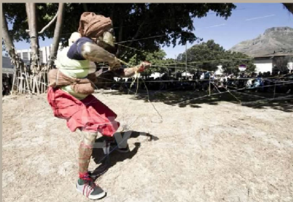
CHILD ABUSE, CAPETOWN SOUTH AFRICA TRAIN STATION, 2012