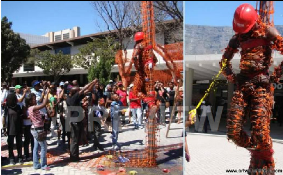
ABAWON/STAIN "2", SOUTH AFRICA, 2012, THIS PIECE HIGHLIGHTS THE STIGMA WE HAVE OF THOSE PEOPLE WHO ARE MENTALLY ILL, HAVE HIV/AIDS, OR ARE DISABLED IN OUR SOCIETIES