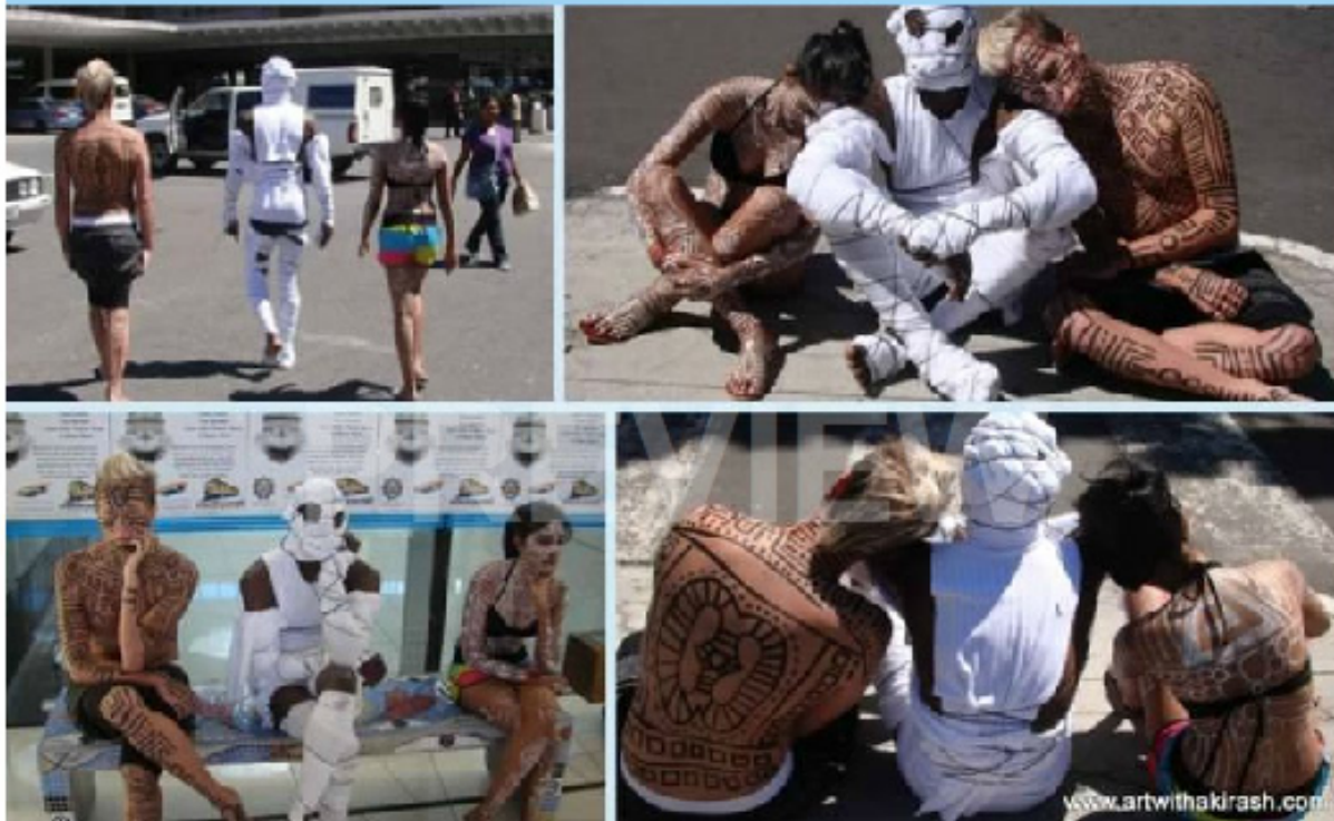
WEMIMO/PURIFICATION, SOUTH AFRICA, 2012, ON CLEANSING.