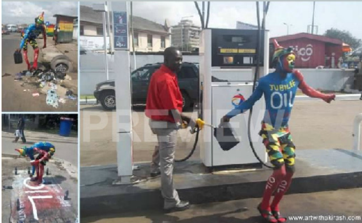
ERE GALE/JUBILEE OIL, ACCRA- GHANA, 2010, WILL GHANA'S DISCOVERY OF OIL BE A BLESSING OR A CURSE?