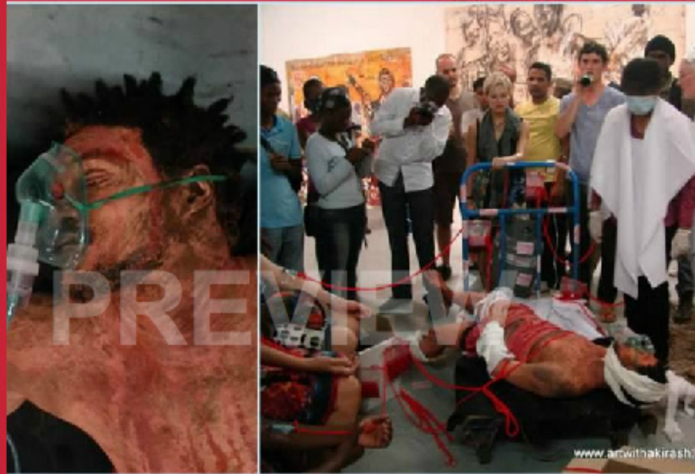
EJE LEPO/ BLOOD DONATION, BAG FACTORY JOBURG-SA, 2012, ON THE IMPORTANCE OF BLOOD DONATION