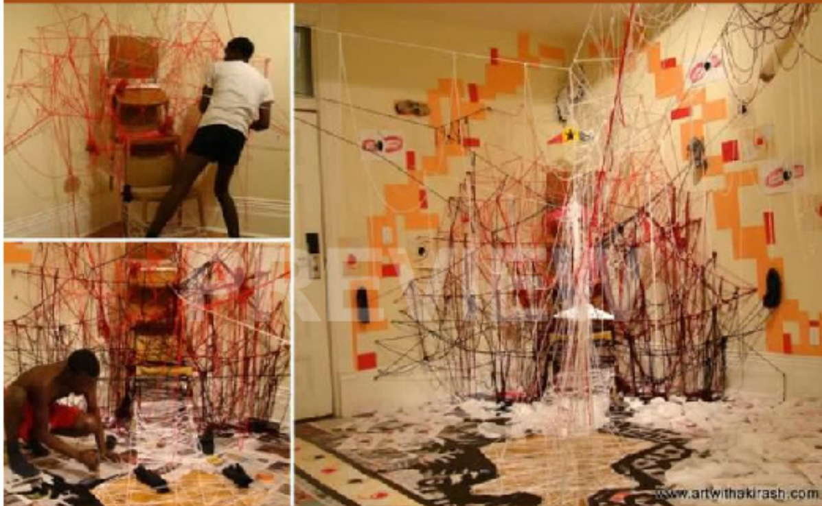
EYIN GEDE/FRAGILE, GLADSTONE HOTEL/GALLERY/ STUDIO,TORONTO-CANADA, 2011, OUTREACH TO REFUGES IN CANADA