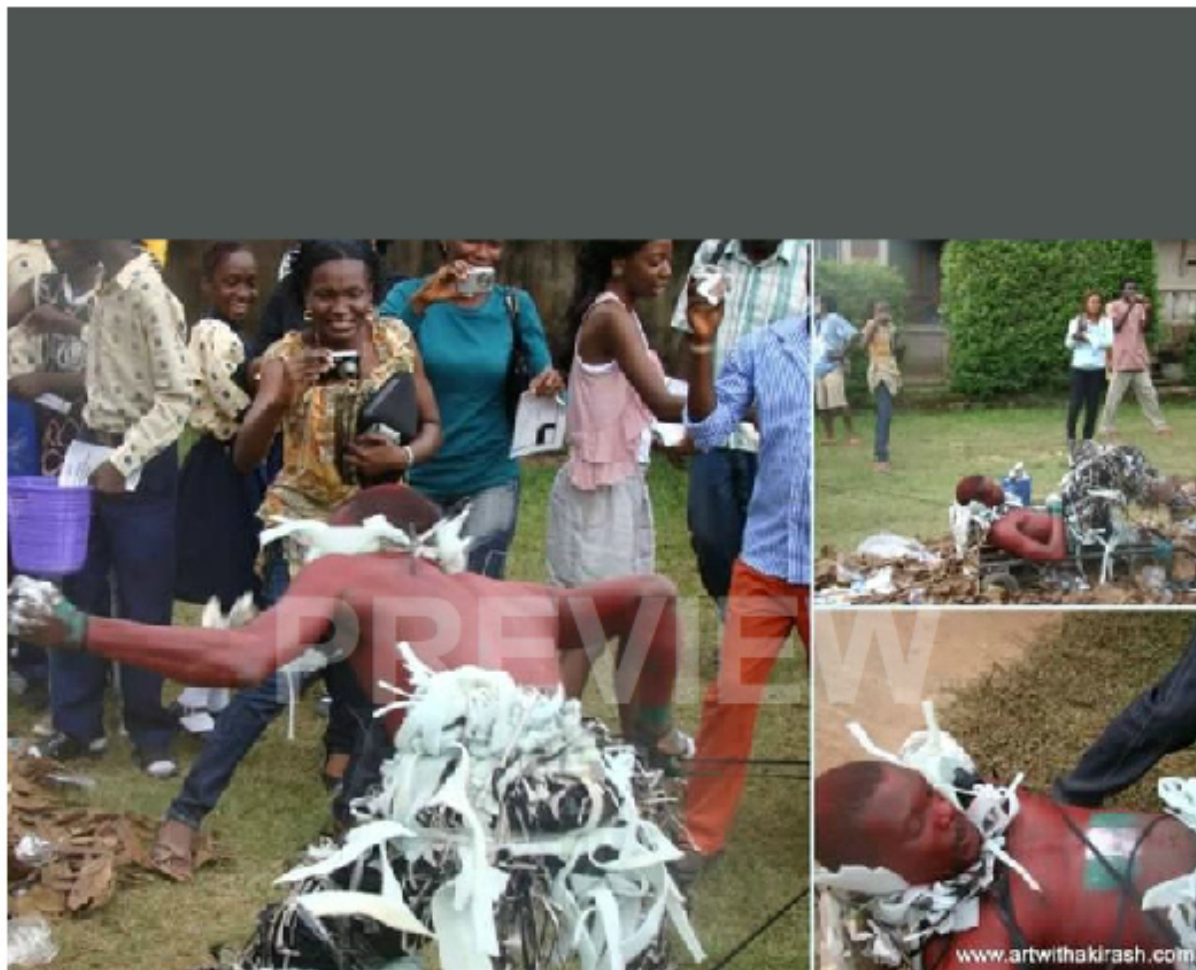
ILE-LE/REFUSE DUMP, LAGOS-NIGERIA, 2010. THIS PERFORMANCE LOOKS AT PLASTIC POLLUTION IN OUR ENVIRONMENT