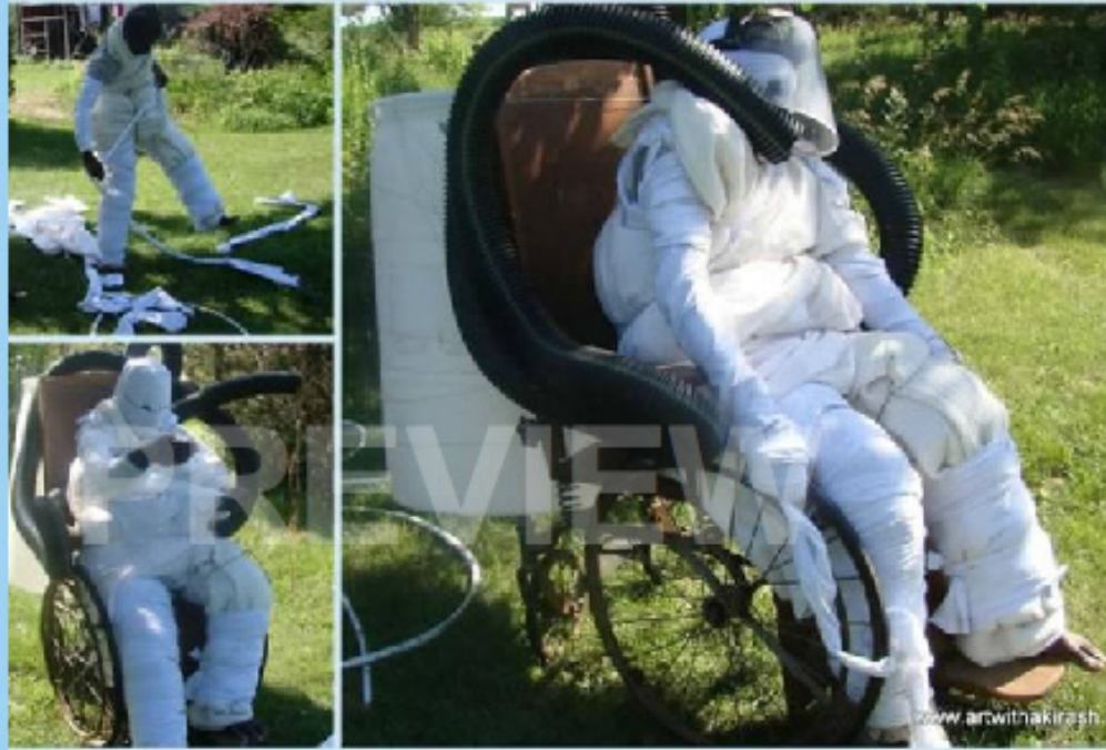
AYIPADA/METAMORPHOSIS, ART FARM NEBRASKA, 2011, WE HUMANS TREAT THE EARTH AS OURS WITHOUT GIVING RESPECT TO OTHER CREATURES.